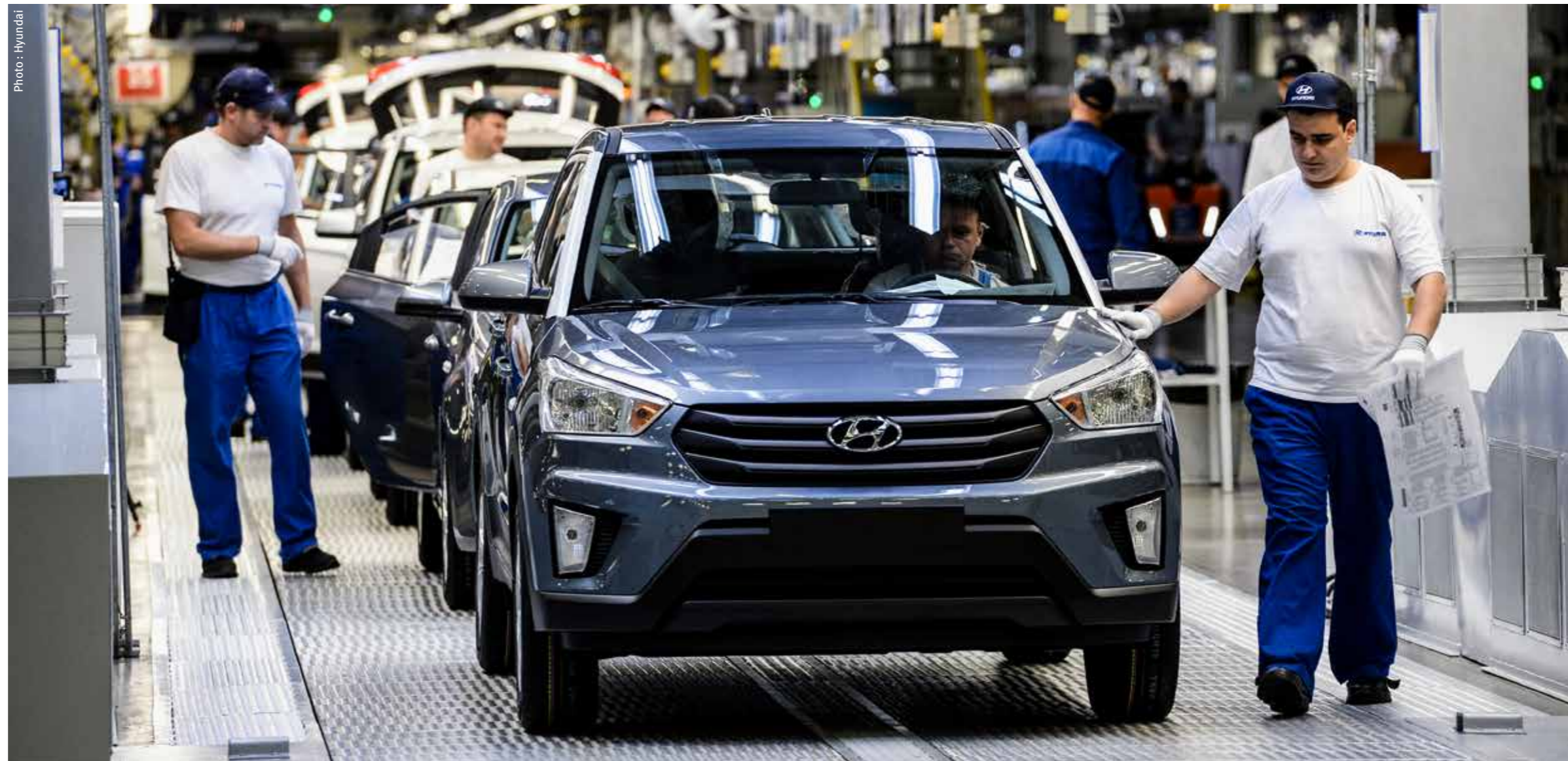
Final quality inspection in a Hyundai car manufacturing plant.

That’s why the Hyundai Motor Company is putting the focus on smart manufacturing systems. Built on the concepts of smart products and smart factories, these form a production environment in which production and logistics systems organize themselves without human intervention. This is known as a “smart ecosystem” and has been a source of great satisfaction to Hyundai Motor and our customers.