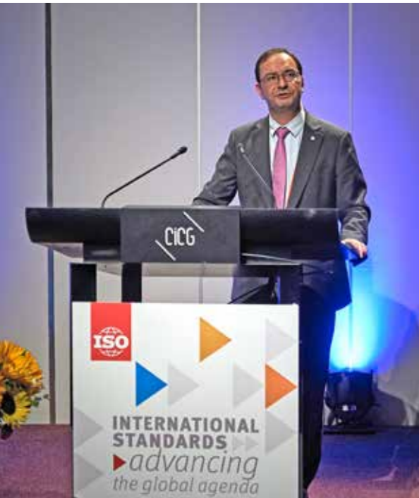
Sergio Mujica, ISO Secretary-General.

To this end, ISO held an interactive session jointly with the United Nations, represented by the United Nations Economic Commission for Europe (UNECE), to discuss how regulators, businesses and standardizers can work together to further contribute to the UN SDGs. ISO also launched a dedicated page on its Web site ( www.iso.org/sdgs ) with a mapping tool that highlights more than 600 standards that contribute directly to achieving the Goals. The new tool is intended to serve as a reference for organizations looking to play their part.