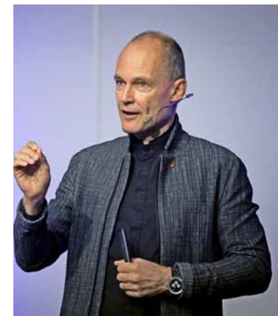
Bertrand Piccard, the leading figure behind Solar Impulse, addressed more than 500 delegates at the 41 st ISO General Assembly.

Change will help us all build a better, more sustainable world.